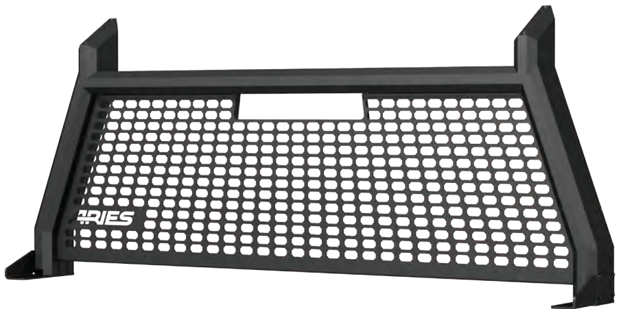
Carbide powder coat