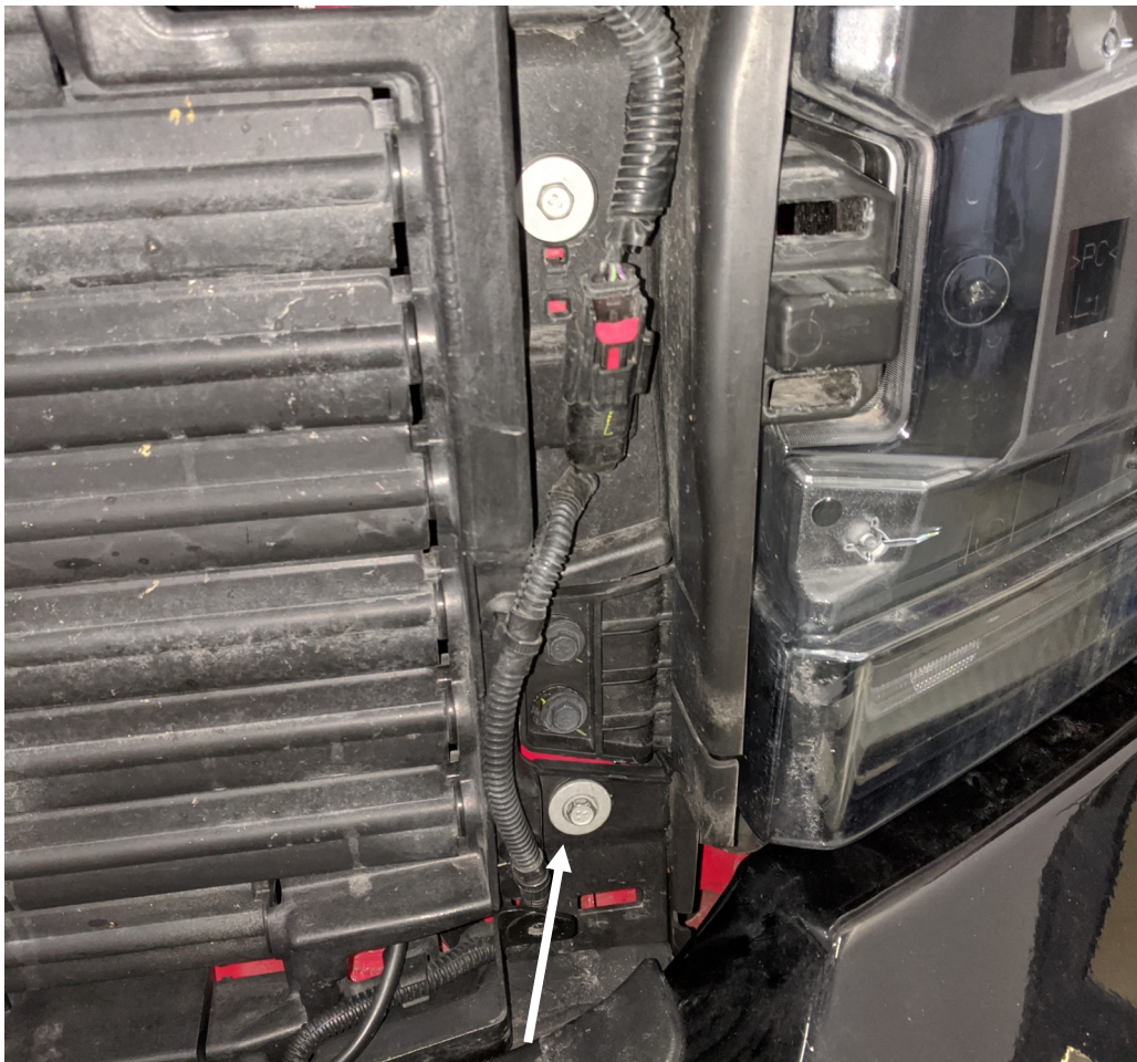
Figure 1: Bracket mounting location.

The brackets are designed to utilize the lower factory mounting locations for the front header panel. These locations are shown in Figure 1 . These bolts will be present with or without the active shutter system.