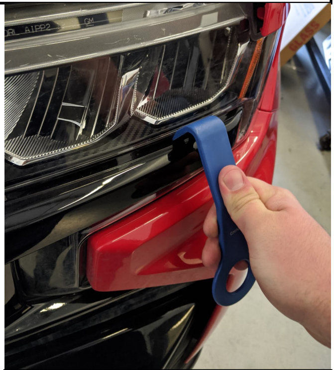
Figure 4: Grille removal.