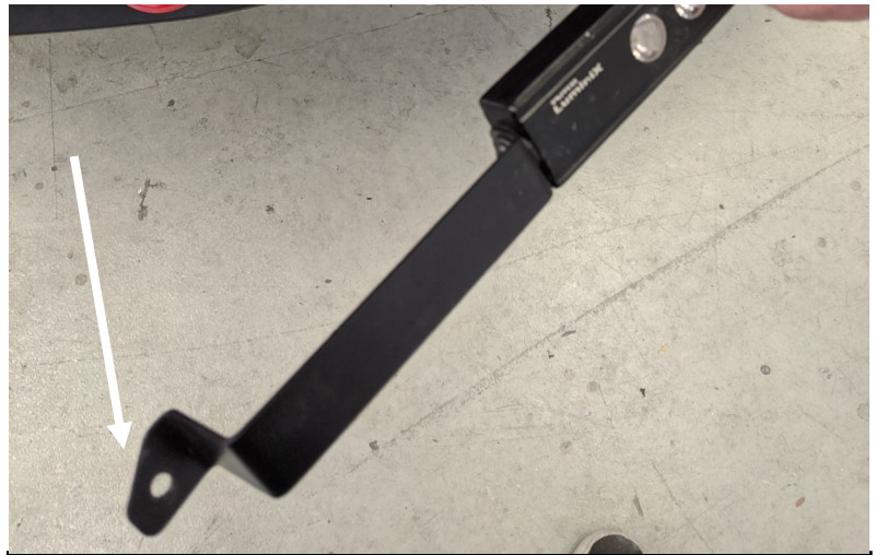
Figure 5: Bracket orientation.