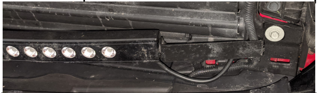
Figure 6: Light bar mounting.