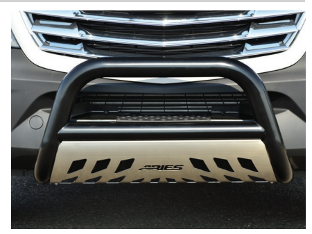
Optional license plate relocation bracket #35-0000 sold separately