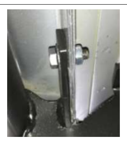
Step 9. Next, tighten the remaining hardware that attaches the bracket to the upper body mount.

Step 8. First, tighten all the hardware that attaches the bracket to the pinch weld of the vehicle.