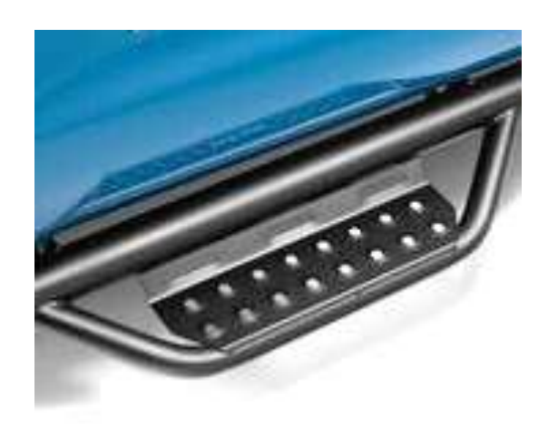
Step 1 . Identify the driver side step.