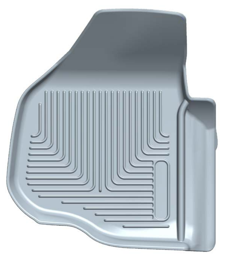
RIGHT OR PASSENGER