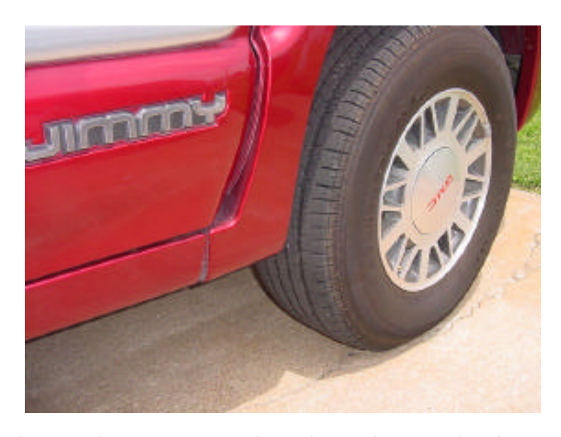
PART NO. 5629 OR 5627 WILL NOT WORK FOR VEHICLES WITH BODY CLADDING OR FENDER FLARES.