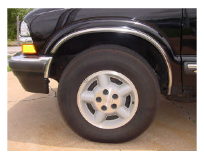
IF VEHICLE HAS FRONT FENDER TRIM MOLDING AS SHOWN ABOVE USE PART NO. 5627

THE 5629 MUD GUARD WILL NOT WORK WITH FENDER TRIM MOLDING OR BODY CLADDING AS SHOWN BELOW: