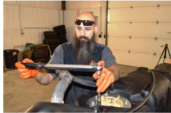
(Fig. 3) Place the sending unit into the TITAN tank, install the top flange, and tighten the nylon lock nuts to 20 ft. lbs using a "star" pattern using a torque wrench.