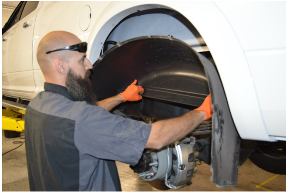
(Fig. 1) Some vehicles may require the removal of the fender liner and perhaps the left rear wheel so as to facilitate access to the tank fill and vent hoses.