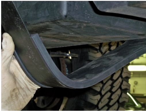
(Fig. 4) If optional TITAN Shield is not to be installed, install rubber bushings (pn 99 0000 0103) on both straps with the channel side toward the strap.