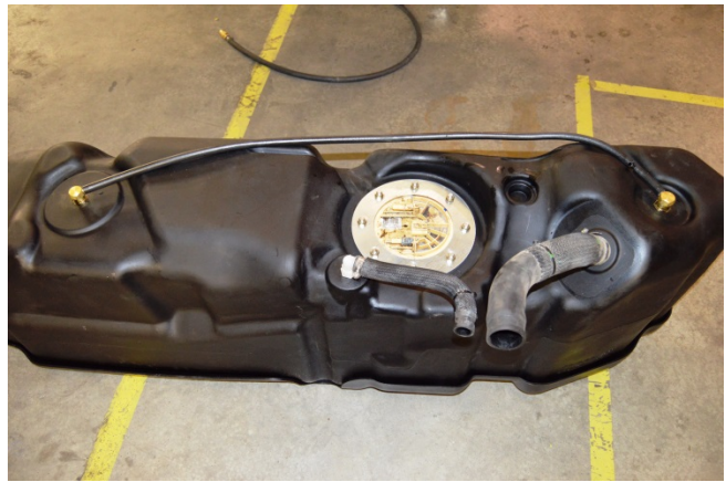
(Fig. 5) Photo shows the fill and main vent hoses transferred and installed on new TITAN tank. Note the 5/16" hose between the two rollover valves. The small line from the vehicle's fill spout will attach to the tee in this line. The tab on the sending unit lines up with the "TAB LOCATOR" marks on the tank body.