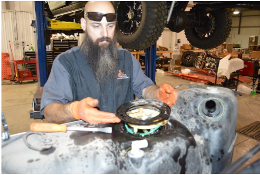
(Fig. 2) Loosen the hold-down ring on the OEM tank by turning counter-clockwise. Note where the connections on your vehicle's sending unit are "clocked" and install so they are located in the same position in the new tank.