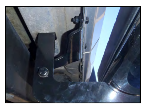
6. Repeat steps 3-5 for the driver center and rear mounting bracket and support bracket. Do not fully tighten at this time.