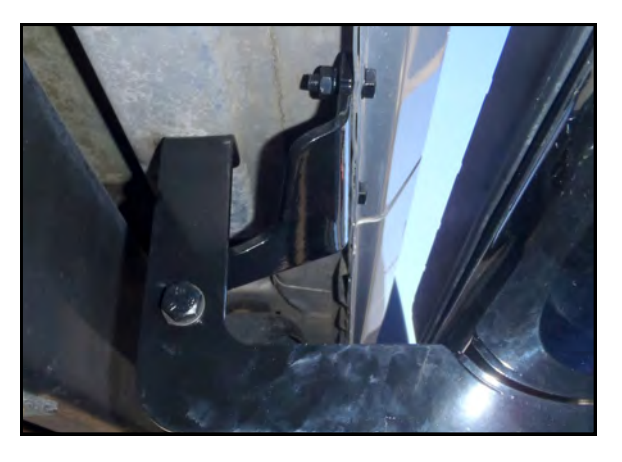
6. Repeat steps 3-5 for the driver rear mounting bracket and support bracket. Do not fully tighten at this time.

7. At this time attach the driver side step bar to the driver side mounting brackets using (x4) M10 hex socket button head screws, (x4) M10 internal toothed lock washers, and (x4) M10 flat washers. 8. Align all mounting brackets and step bar as desired. Tighten all M8 fasteners to 14 lb-ft. Tighten M10 hex cap screws to 30 lbs-ft. Tighten all M10 button head screws to 18 lbs-ft.