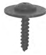
SEM Screws (8)