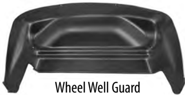
Wheel Well Guard Driver's Side (1)