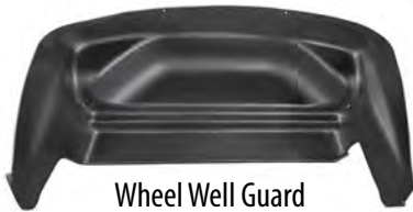
Wheel Well Guard Passenger's Side (1)