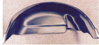
Wheel Well Guard Passenger's Side (1)