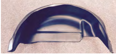
Wheel Well Guard Driver's Side (1)