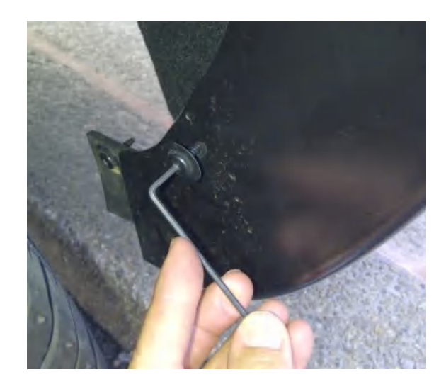
STEP 12: Using #15 Torx head screwdriver reinstall the upper screw from the rear factory mudguard through the slot in the Fender Flare. Ensure all fixing points are tight and secure and that the rubber seal is flush neatly against the vehicle body.

STEP 11: Slide the top edge of rear front mudguard cut out behind the factory mudguard. Install the E shape clip so that the clip slides over the inner sheet metal lip and is in line with the slot in the underside of Fender Flare. To secure the clip to Fender Flare apply inward tension on Fender Flare to the vehicle fender when installing the E clip, position the clip so that the barb in the clip locates in the slot of the Fender Flare.