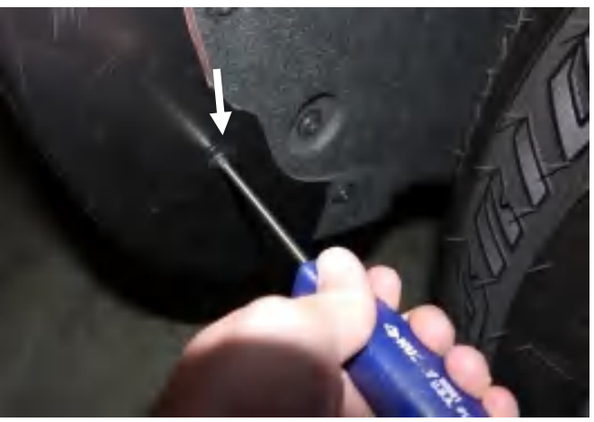
STEP 6: Re-install factory screw in the mudguard using #15 Torx head screwdriver through the slot in the Fender Flare.

STEP 5: Place Fender Flare on the vehicle into the position of best fit so the slots in position A and B are over the holes in the front end of large clips. Ensure bottom rear slot in Fender Flare is located over the vacate hole in the factory mudguard. Apply upward tension on Fender Flare to the vehicle fender when Installing the screws and washers provided into the clips in position A and B using a Philips head screwdriver.