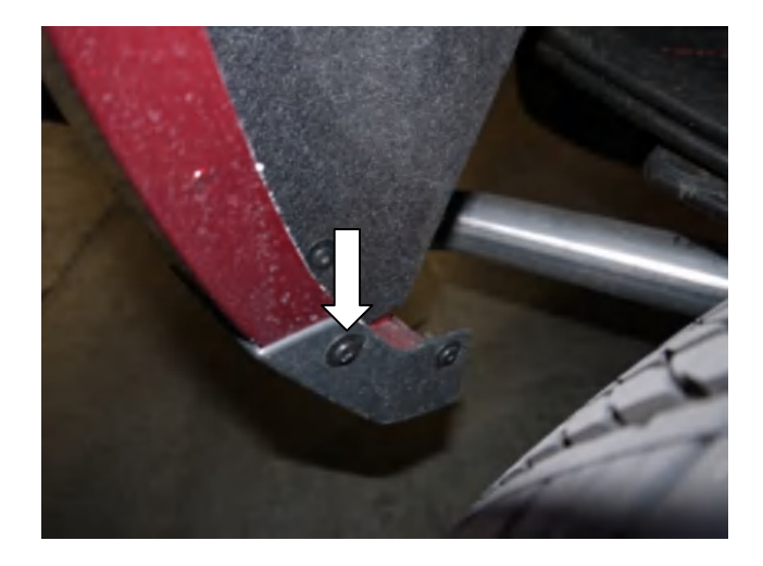
STEP 9: Using #15 Torx head screwdriver remove upper screw from the rear factory mudguard. Maintain screws for re-install.