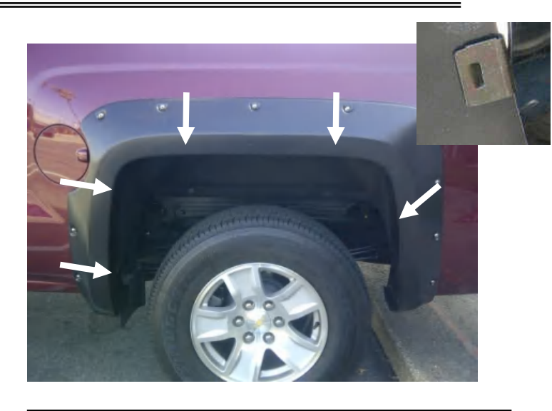
STEP 10: To secure the Fender Flare to the body, apply upward tension on Fender Flare to the vehicle fender when installing the black metal clips. Slide the clips over the Fender Flare and the inner wheel arch lip in the five locations shown. Position the clip so that the barb in the clip locates in the slot of the Fender Flare.