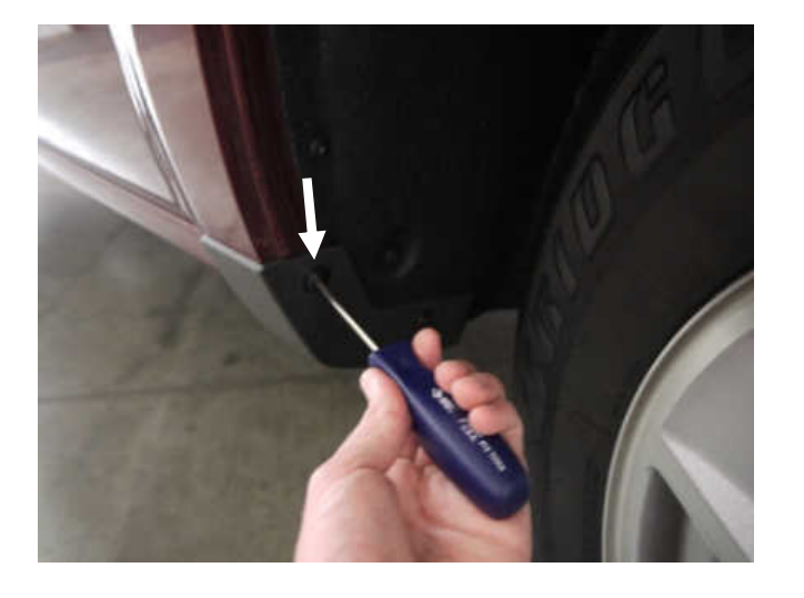
STEP 3: Using #15 Torx head screwdriver remove upper screw from the front factory mudguard. Maintain screws for re-install.