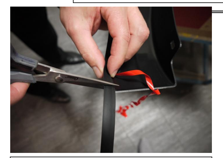
STEP 3: Trim excess rubber seal and discard.