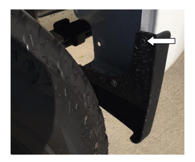
STEP 13: Using #15 Torx head screwdriver remove upper screw from the front factory spat in the rear wheel arch. Maintain screws for re-install.