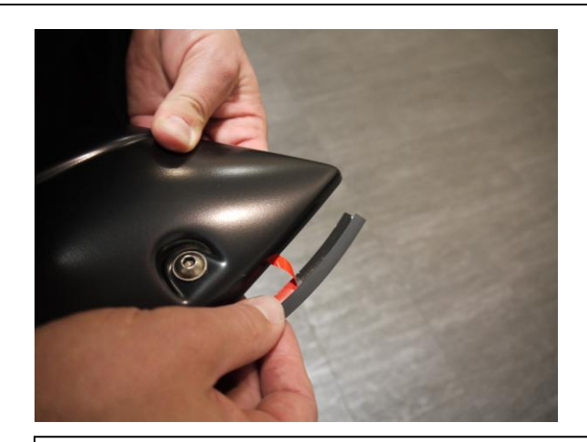
STEP 2: Attach the included rubber seal to the Fender Flares. Peel back 2" of the adhesive backing and position on the Fender Flare. Attach the seal to the Fender Flare, peeling back a few inches at a time. Ensure pressure is used to secure rubber seal to Fender Flare edge. Attach rubber seal along all areas the Fender Flare will make contact with the vehicle body.

STEP 1: Attach the bolts and nuts to each Fender Flare using a 3/16" Allen key/Trox and a 1/2" wrench/socket. wrench/socket. (wrench /socket and Allen key not supplied). Ensure inside of Fender Flares where the rubber seal is attached is clean, using the alcohol wipes provided. Wipe away any residue with a dry clean cloth.