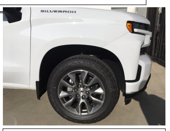
STEP 4: Clean the body areas where the Fender Flares will make contact. Ensure fenders are dry prior to install. Turn tires outward for Fender Flare installation.