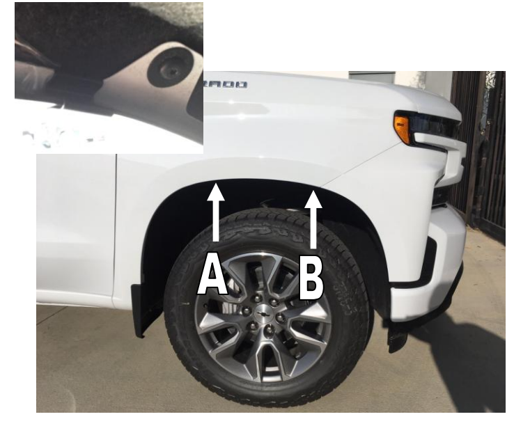
STEP 6: Place Fender Flare on the vehicle into the position of best fit. Note where the slots in Fender Flare at positions A , B and vehicle wheel arch. Remove Fender Flare. Place the small abrasive resistant tapes over the fender lip at the noted posistions A , B . Slide the large clips over the inner fender pannel at the noted A , B positions, ensure the hook on the back of the clip engages over the fender lip.

STEP 5: For models <u>with front</u> factory mud guards, remove using #15 Torx head screwdriver at the upper and lower screw locations from the front factory mudguards and M10 socket at the underside location indicated above, maintain #15 Torx head screws for re-install . Retain factory mudguards for later use if required, fender flares require the mud guards to be removed.