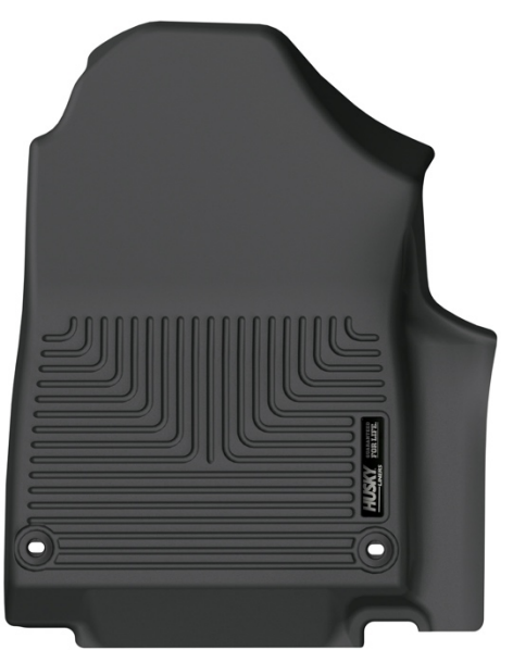
RIGHT OR PASSENGER'S

TO EASE INSTALLATION OF YOUR NEW FRONT LINERS, MOVE BOTH FRONT ROW SEATS TO THEIR MOST REARWARD POSITION. WITH THIS DONE, INSTALL THE LINERS AS SHOWN ABOVE. THE DRIVER AND PASSENGER SIDE LINER WILL ATTACH TO THE FACTORY FLOOR MAT TWIST LOCKS. ONCE YOU HAVE INSTALLED YOUR LINERS, REPOSITION THE SEATS AS DESIRED.