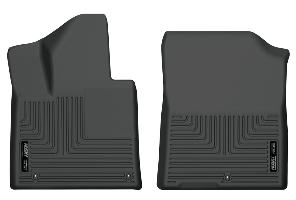
LEFT OR DRIVER'S