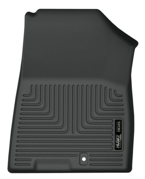
RIGHT OR PASSENGER'S

TO EASE INSTALLATION OF YOUR NEW FRONT LINERS, MOVE BOTH FRONT ROW SEATS TO THEIR MOST REARWARD POSITION. WITH THIS DONE, INSTALL THE LINERS AS SHOWN ABOVE. THE DRIVER AND PASSENGER SIDE LINER WILL ATTACH TO THE FACTORY FLOOR MAT RETAINING POSTS. ONCE YOU HAVE INSTALLED YOUR LINERS, REPOSITION THE SEATS AS DESIRED.