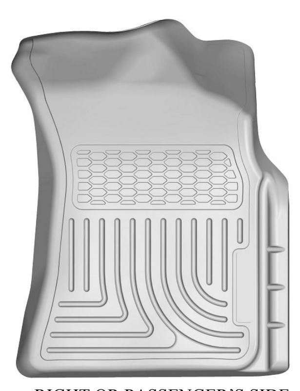
RIGHT OR PASSENGER'S SIDE

YOUR TOYOTA TACOMA MAY HAVE A FACTORY MAT RETAINER INSTALLED THAT COULD AFFECT THE FIT OF YOUR LINER. PLEASE READ THE INSTALLATION NOTES FOR EACH TYPE OF FACTORY MAT RETAINER BEFORE INSTALLING YOUR LINERS: