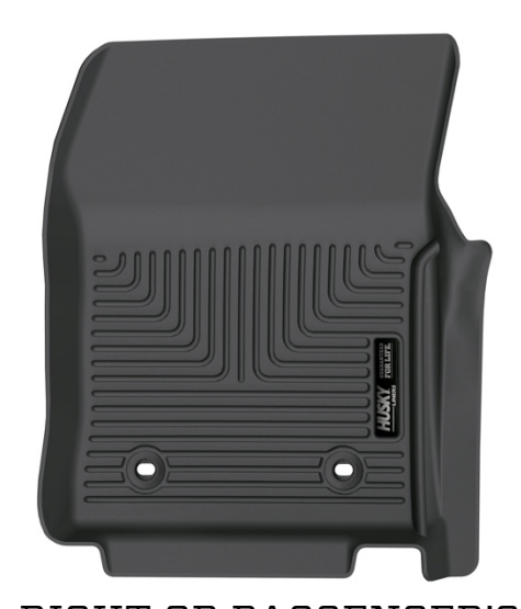
RIGHT OR PASSENGER'S

TO EASE INSTALLATION OF YOUR NEW FRONT LINERS, MOVE BOTH FRONT ROW SEATS TO THEIR MOST REARWARD POSITION. WITH THIS DONE, INSTALL THE LINERS AS SHOWN ABOVE. THE DRIVER AND PASSENGER SIDE LINER WILL ATTACH TO THE FACTORY FLOOR TWIST LOCKS. ONCE YOU HAVE INSTALLED YOUR LINERS, REPOSITION THE SEATS AS DESIRED.