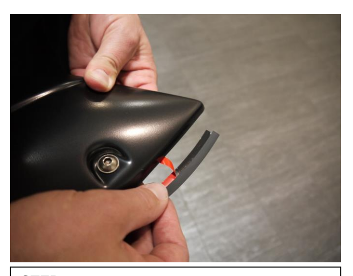
STEP 2: Attach the included rubber seal to the Fender Flares. Peel back 2" of the adhesive backing and position on the Fender Flare. Attach the seal to the Fender Flare, peeling back a few inches at a time. Attach rubber seal along all areas the Fender Flare will make contact with the vehicle body.

STEP 1: Attach the extruded plastic bolts. Peel back white tape liner from the bottom side of the extruded plastic bolt and press until it snaps into place. Ensure inside of Fender Flares where the rubber seal is attached is clean, using the alcohol wipes provided. Wipe away any residue with a dry clean cloth.