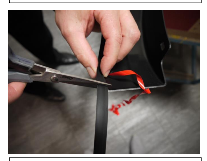
STEP 14: Trim any unnecessary extrusion and discard.

STEP 13: Pulling at right angles to the extrusion, remove the liner from the extrusion in small portions and apply thumb pressure to ensure that it adheres to the Fender Flares.