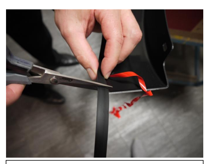
STEP 4: Trim any unnecessary extrusion and discard.

STEP 3: Pulling at right angles to the extrusion, remove the liner from the extrusion in small portions and apply thumb pressure to ensure that it adheres to the Fender Flares.