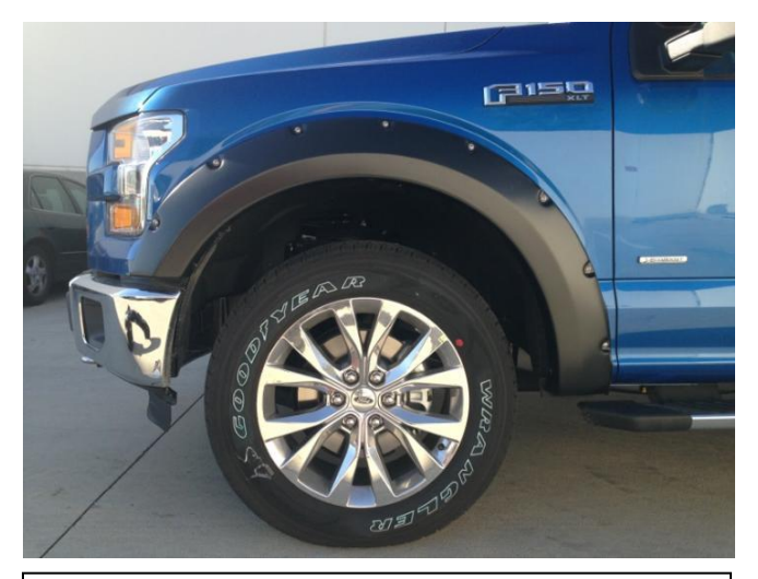
STEP 10: Repeat installation method for other side. Double check the front Fender Flares to make sure all bolts are tight and clips are securely fastened.

STEP 9: Reinstall the remaining 5.5mm bolt and two 7mm bolts.