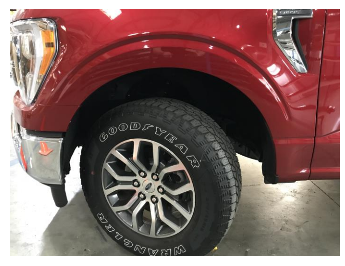
STEP 5: Clean the body areas where the Fender Flares will make contact with a clean cloth.