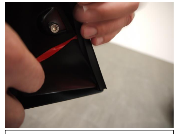
STEP 3: Pulling at right angles to the extrusion, remove the liner from the extrusion in small portions and apply thumb pressure to ensure that it adheres to the Fender Flares.