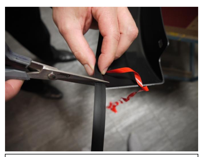
STEP 4: Trim any unnecessary extrusion and discard.