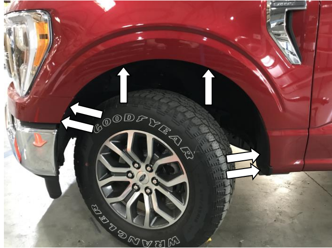
STEP 6: Locate six 7mm bolts in the vehicle wheel well.

For models equipped with factory fender flares, removal of factory flares are required, please consult the vehicle service manual for factory fender flare removal.