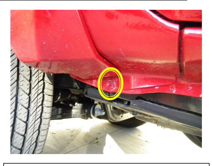
STEP 4: Again using a 10mm socket, remove the screw from the body sheet metal join referenced in STEP 5 as Special Note area "A" and retain for later re-installation.