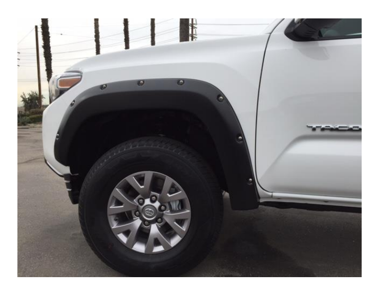
STEP 9: If necessary, make minor adjustments to the flares position to achieve the best fit for your vehicle and to ensure that the rubber seal is sitting flat against the painted vehicle surface. When satisfied fully tighten all (5) screw locations, in the above order in which they were just installed. Repeat install for opposite side.