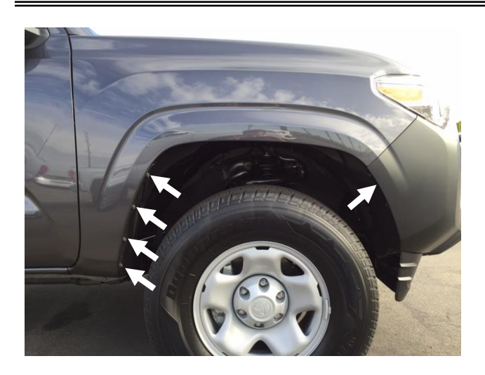
STEP 3: For models <u>without</u> factory installed Fender Flares, remove the (5) above indicated screws from the wheel liner with a 10mm socket and retain for later reinstallation.

( Fits with or without factory installed Fender Flares, but without factory Mud Guards )