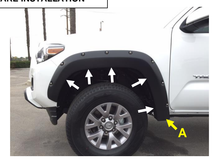
STEP 2: Hold Fender Flare on the vehicle in the position of best fit. For models <u>with</u> factory installed Fender Flares, note where above marked holes in Fender Flare align with existing screws in the vehicle. Make special note of "A". Remove the EGR Fender Flare and remove the (5) above indicated screws from the factory flare with a 10mm socket. <u>DO NOT</u> remove the factory flare, the EGR Fender Flare installs directly over the factory flare.