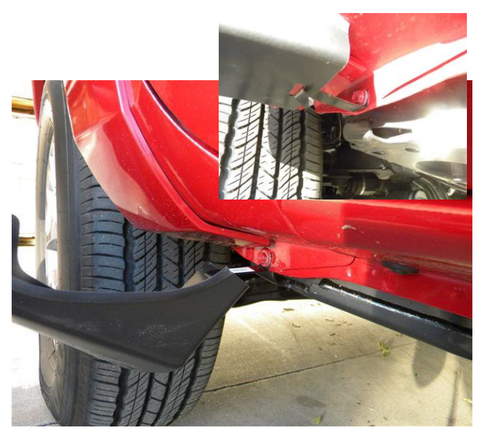
STEP 6: Begin installation by engaging the hook end of the clip into the slot in the bottom of the Fender Flare and begin rotating the Fender Flare vertically up to its position of best fit.

Fully tighten screw and ensure that finished position of clip is horizontal to ground, with the hook end pointing down.