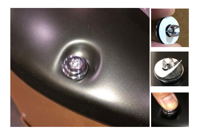
STEP 1: Attach the extruded plastic bolts. Peel back white tape liner from the bottom side of the extruded plastic bolt and press until it snaps into place. Ensure inside of Fender Flares where the rubber seal is attached is clean, using the alcohol wipes provided. Wipe away any residue with a dry clean cloth.

PAINTING INSTRUCTIONS – If Fender Flares are being painted; do not install edge extrusion until painting is complete. Prior to painting, clean all surfaces to be painted using clean water and a mild detergent, do not use lacquer thinner or any solvent based products. Wipe completely dry. Best results will be achieved by wiping the areas to be painted with a tack rag just prior to painting. Most automotive paints can be applied directly to the Fender Flares, however some may require a primer (check paint manufacturer specifications). Good adhesion will be achieved without sanding. Select a paint (and primer if necessary) that is suitable for rigid plastics PMMA (Acrylic). If using a paint system that requires baking, do not expose the product to temperatures above 70°C (158°F). Do not fit the extrusion or any of the hardware to the Fender Flares until the paint is completely dry.