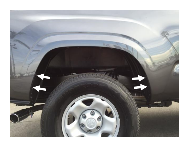
STEP 12: For models <u>without</u> factory installed Fender Flares, remove <u>only</u> the first (4) above indicated screws, from top to bottom of the fender, (2) each side, with a 10mm socket and retain for later re-installation.