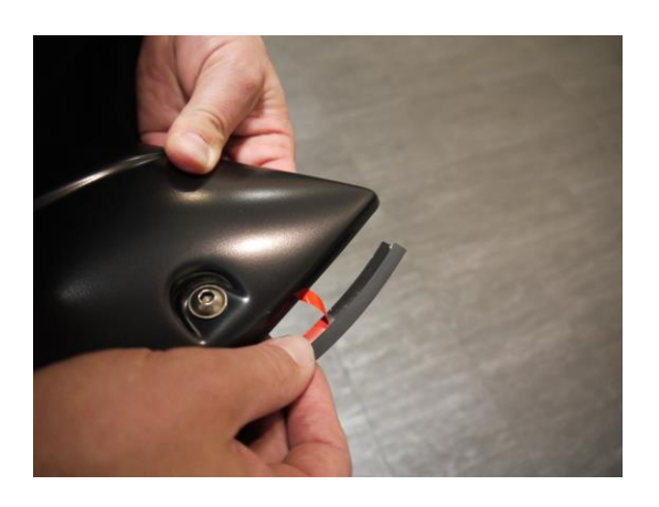
STEP 2: Attach the included rubber seal to the Fender Flares. Peel back 2" of the adhesive backing and position on the Fender Flare. Attach the seal to the Fender Flare, peeling back a few inches at a time. Ensure pressure is used to secure rubber seal to Fender Flare edge. Attach rubber seal along the top leading edge of the Fender Flare where it will make contact with the vehicle body.