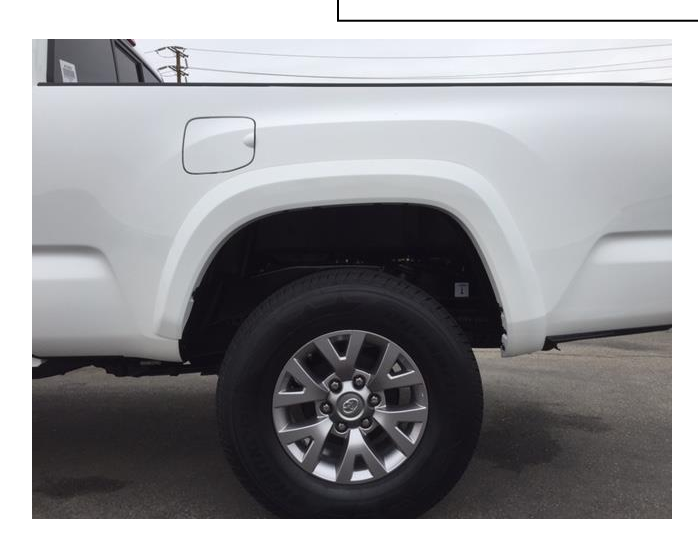
STEP 10: Clean the vehicle body areas with a mild soap and water solution, where the Fender Flares will make contact. Ensure fenders are dry prior to install.