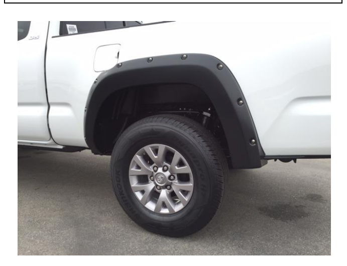
STEP 16: If necessary, make minor adjustments to the flares position to achieve the best fit for your vehicle and to ensure that the rubber seal is sitting flat against the painted vehicle surface. When satisfied fully tighten all screw locations, in the above order in which they were just installed. Repeat install for opposite side.