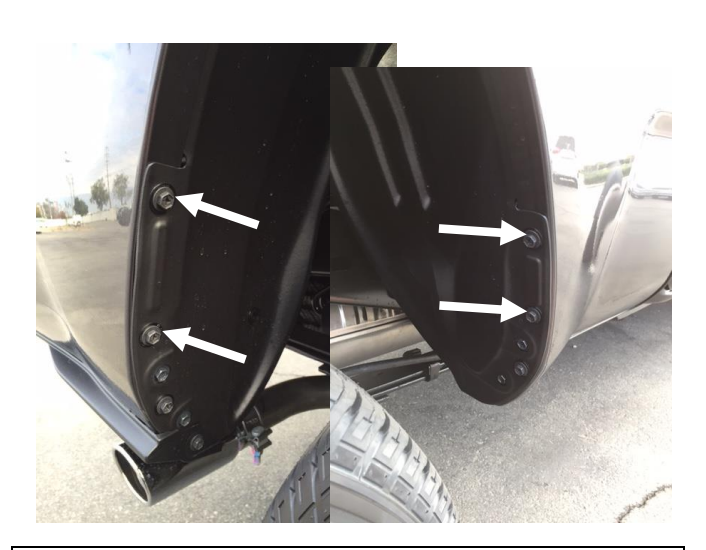
STEP 12a: Remove ONLY these (4) above indicated screws as mentioned in previous STEP 15, with a 10mm socket for models <u>without</u> factory installed Fender Flares. Leave all other remaining screws in wheel liner area. EGR Fender Flare will install directly over the remaining screws.