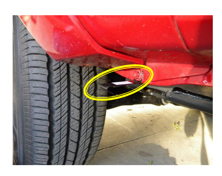
STEP 5: Remove Hooked end Long Clip from hardware kit and install in above shown orientation using the 10mm screw removed from the body sheet metal join in STEP 8 as Special Note area "A".

Fully tighten screw and ensure that finished position of clip is horizontal to ground, with the hook end pointing down.