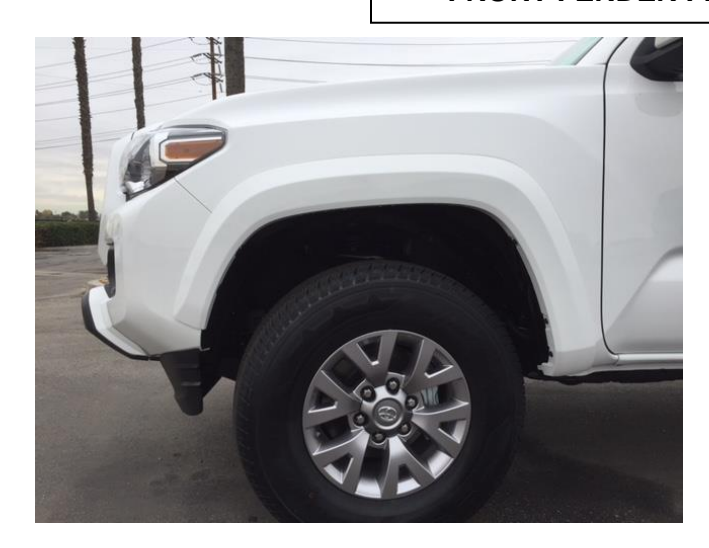
STEP 1: Clean the vehicle body areas with a mild soap and water solution, where the Fender Flares will make contact. Ensure fenders are dry prior to install.