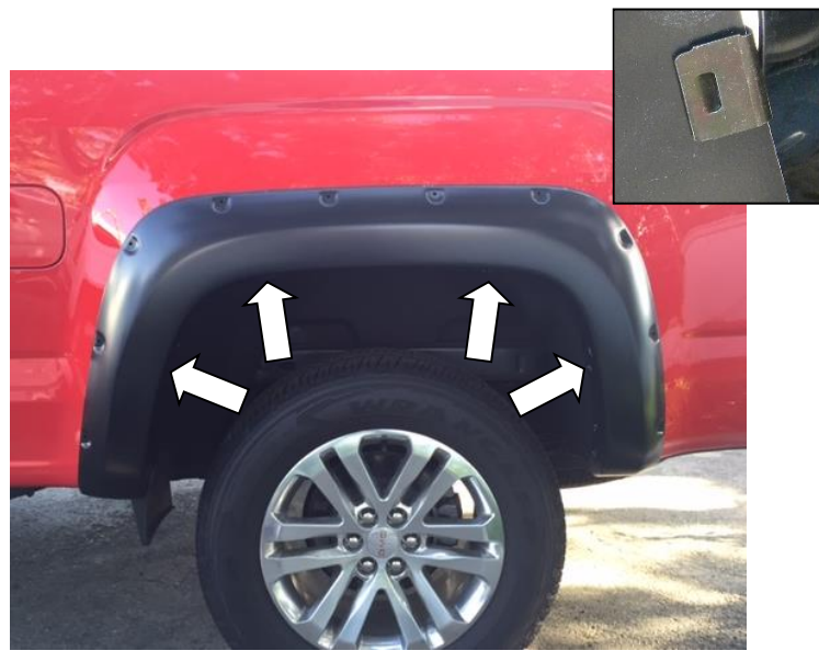
STEP 13: Install the provided U shape metal clips at the (4) remaining slot locations in the Fender Flare. Ensure that positive pressure is applied on the Fender Flare to the vehicle fender when installing clips. Slide the clips over the Fender Flare and the inner lip of the wheel arch molding ensuring that the barb in the clip locates in the slot of the Fender Flare.

STEP 12: Place Fender Flare on the vehicle into the position of best fit, slide the bottom front end of Fender Flare between the existing mud flap deflector and wheel arch molding so that the slot in the Fender Flare is under the vacant hole in the mud flap. Using #15 Torx head screwdriver, loosely re-install the previously removed screw from front factory deflector.