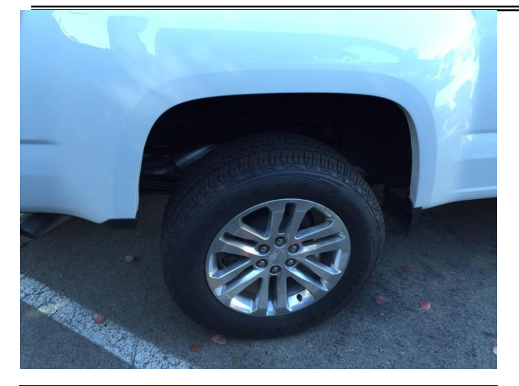
STEP 10: Clean the body area where the Fender Flares will make contact. Ensure fenders are dry prior to install.

Bolt-Style Look Fender Flares GMC Canyon (15-On)