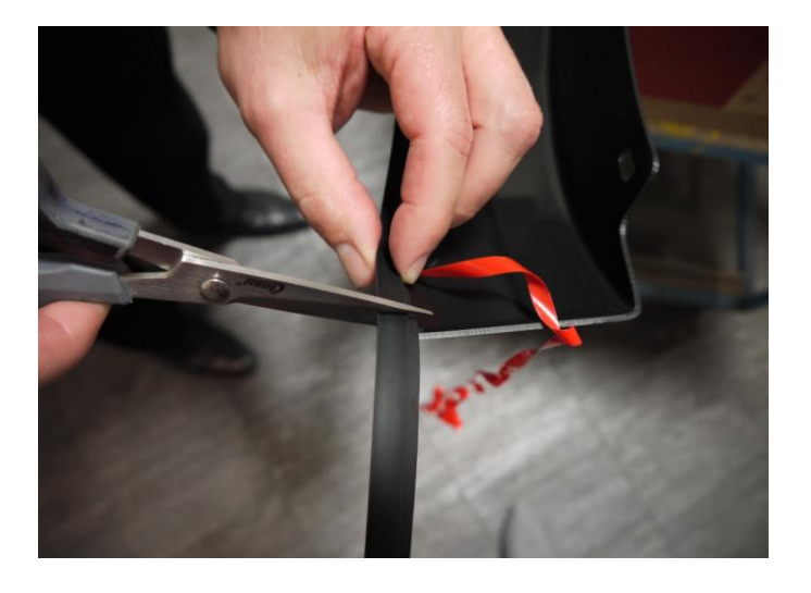
STEP 2: Trim excess rubber seal and discard.

*Picture may differ from actual product*