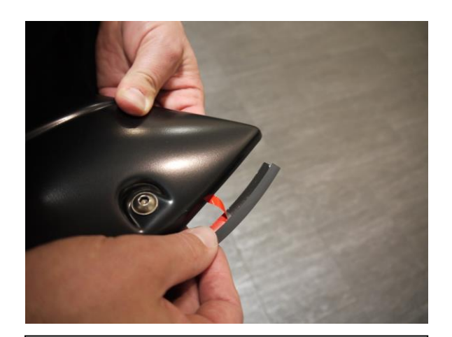
STEP 1: Attach the included rubber seal to the Fender Flares. Peel back 2" of the adhesive backing and position on the Fender Flare. Attach the seal to the Fender Flare, peeling back a few inches at a time. Ensure pressure is used to secure rubber seal to Fender Flare edge. Attach rubber seal along all areas where the Fender Flare contacts the vehicle body.

Ensure that both left- and right-hand Fender Flares suit the profile of the vehicle. Note the areas where the Fender Flares come in contact with the vehicle. NOTE: Before fitting Fender Flares remove any moldings, strips or existing flares from the wheel arch. If there is a body side molding, mark where the molding is to be cut, alternatively the Fender Flare can be cut to go around the molding. Be sure to allow enough room for the extrusion. No drilling of vehicle is required for Rugged Style Fender Flares. This is a non-drill product.