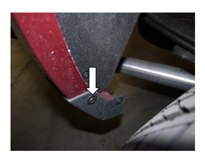
STEP 12: Using #15 Torx head screwdriver remove upper screw from the rear factory mudguard. Maintain screws for re-install.

Rugged Style Fender Flares Chevy Silverado 1500,2500,3500 (14-18) FF993