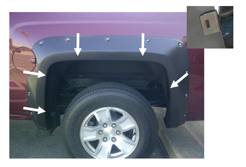
STEP 13: To secure the Fender Flare to the body, apply upward tension on Fender Flare to the vehicle fender when installing the black metal clips. Slide the clips over the Fender Flare and the inner wheel arch lip in the five locations shown. Position the clip so that the barb in the clip locates in the slot of the Fender Flare.