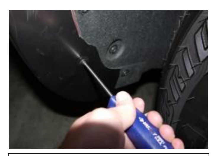
STEP 8: Re-install factory screw in the mudguard using #15 Torx head screwdriver through the slot in the Fender Flare.