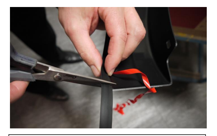
STEP 10: Trim any excess rubber seal and discard.