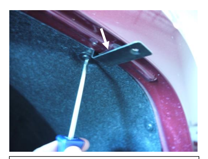
STEP 6: To avoid the metal clip chafing the vehicle paint, apply clear tape to the inside edge of the fender wheel arch in front of positions A , B and C (step 4) over mastic sealant. Install the large brackets in positions A , B and C (step 4) aligning the slot in the bracket with the vacant holes from the factory screws in the vehicle wheel arch. Ensure clips are positioned over the clear tape. Re-install the factory screws in location A , B and C using a #15 Torx head screwdriver.

Rugged Style Fender Flares Chevy Silverado 1500,2500,3500 (14-18) FF993