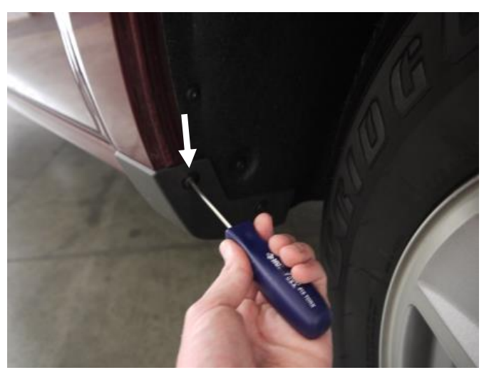
STEP 5: Using #15 Torx head screwdriver remove upper screw from the front factory mudguard. Maintain screws for re-install.