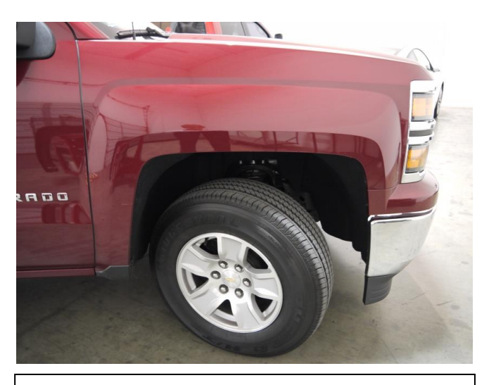
STEP 3: Clean the body areas where the Fender Flares will make contact. Ensure fenders are dry prior to install. Turn tires outward for Fender Flare installation.

Rugged Style Fender Flares Chevy Silverado 1500,2500,3500 (14-18) FF993