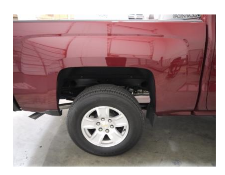
STEP 11: Clean the body areas where the Fender Flares will make contact. Ensure fenders are dry prior to install.