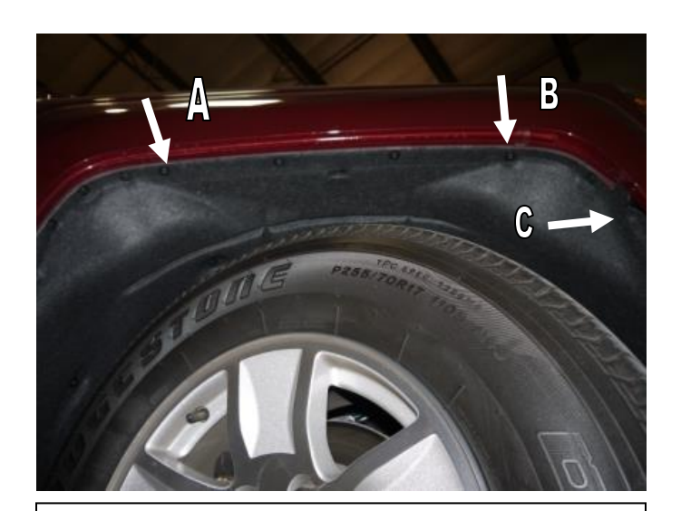
STEP 4: Dry fit the Fender Flare onto the vehicle in the position of best fit. Note where the slots in Fender Flare at positions A , B and C align with the existing screws in the vehicle wheel arch. Remove Fender Flare. Remove the existing vehicle screws in location A , B and C using #15 Torx head screwdriver. Maintain screws for re-install.