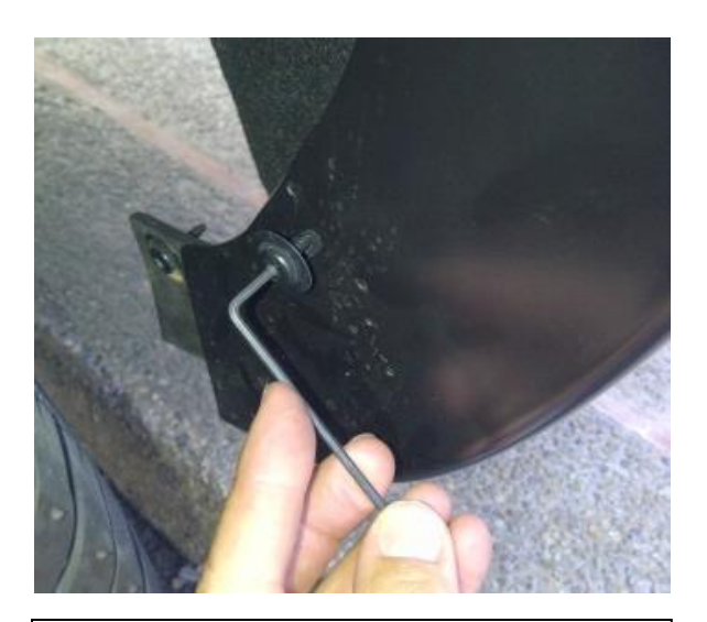
STEP 14: Using #15 Torx head screwdriver reinstall the upper screw from the rear factory mudguard through the slot in the Fender Flare. Ensure all fixing points are tight and secure and that the rubber seal is flush neatly against the vehicle body.