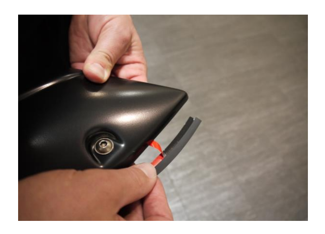
STEP 9: Attach the included rubber seal to the Fender Flares. Peel back 2" of the adhesive backing and position on the Fender Flare. Attach the seal to the Fender Flare, peeling back a few inches at a time. Ensure pressure is used to secure rubber seal to Fender Flare edge. Attach rubber seal along all areas where the Fender Flare contacts the vehicle body.