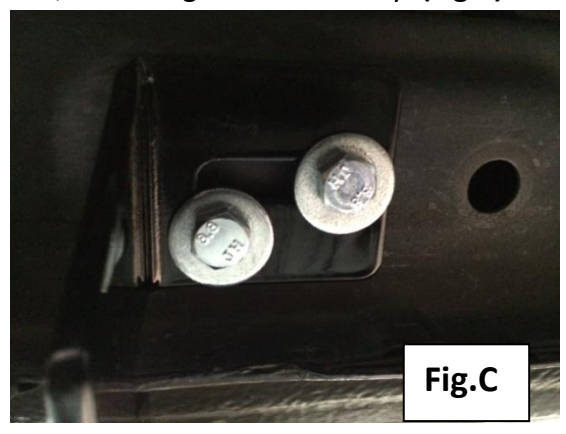
Step 4: Move to the front bracket and insert hardware finger tight and then to the rear bracket.

Step5: Once you have the hardware snug in the rear bracket, raise nerf-step into position close to the body and torque the bolts to 15-20ft./lbs. Then move to the front bracket and level step with the rear and torque bolts. Finsh by torquing down bolts in center bracket completting the install.