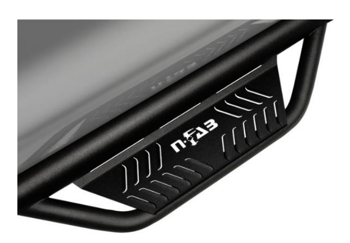
Step 1: Locate the driver side step rail.