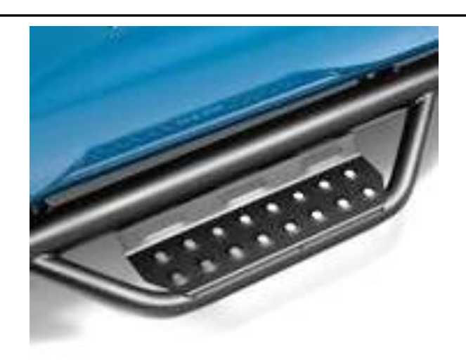
Step 1: Locate the driver side step rail.