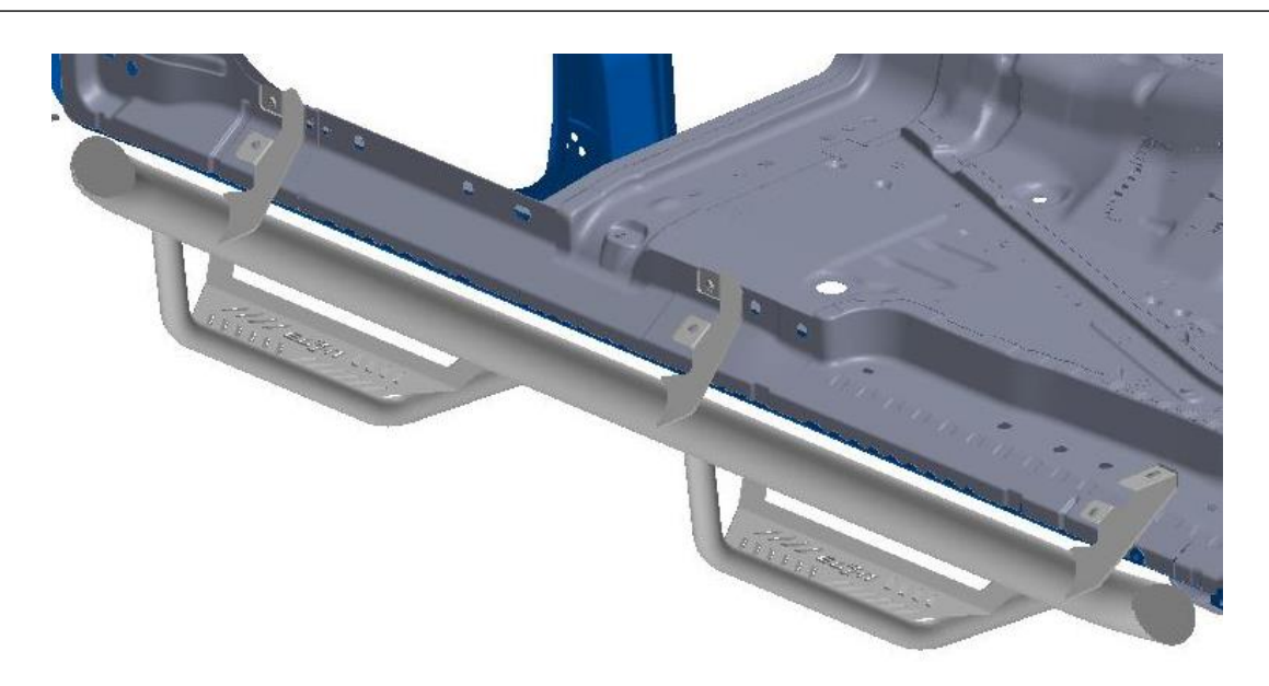
Step 5. Carefully place step into place and loosely fasten using the supplied M10X25mm hardware.

PRODUCT: PODIUM HOOP STEP APPLICATION: FORD BRONCO 4DR