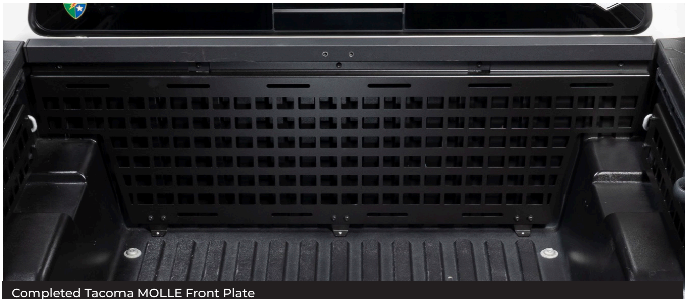
Completed Tacoma MOLLE Front Plate

Your new MOLLE Panel is now successfully installed on your vehicle!