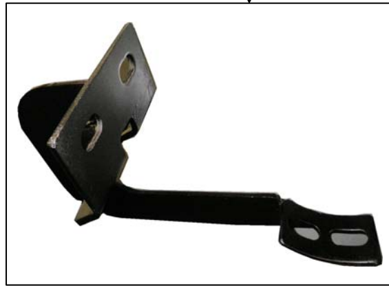
Passenger Side Front Bracket