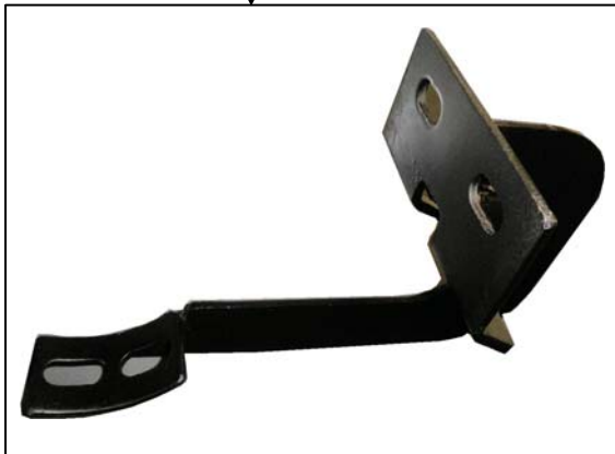
Driver Side Front Bracket