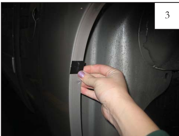
Center a supplied black plastic tab over each mark made in Step 3, aligning edge of tab with inside of fender lip (tab may extend over outside of fender).