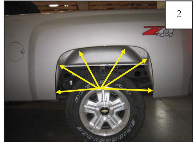
Six hole locations.