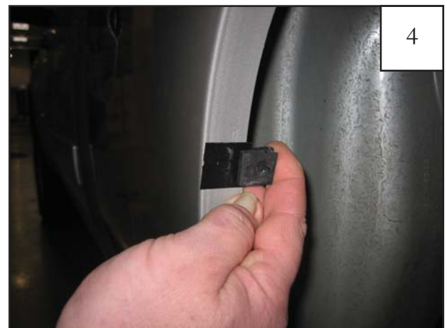
Slide a supplied clip over each black tab. Clips may need to be adjusted to align with holes in flare.