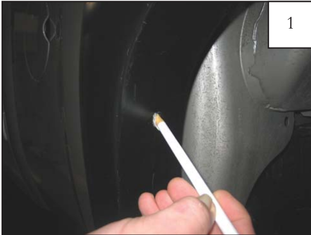
Holding flare in position on fender, use a grease pencil to mark six hole locations.