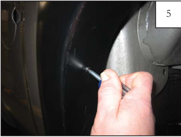
Reposition flare on fender. Start a supplied serrated-flange screw through the hole in the flare, and into each clip.