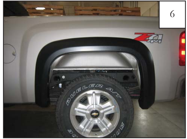
Verify fit and tighten all screws.