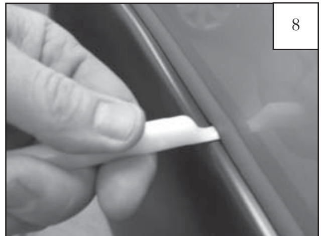
Using flat end of supplied Edge Trim Tool (ET1-0002), seat edge trim against flare by inserting straight end between edge trim and flare at one end. Next, slide around entire edge to the other end.