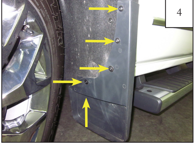
FOR MODELS WITH FACTORY MUDFLAP: Remove mud flap fasteners. Use T-30 Torx bit for two upper fasteners. Use T-15 Torx Bit for two lower fasteners and use a Phillips Head Screwdriver for Bottom fastener.