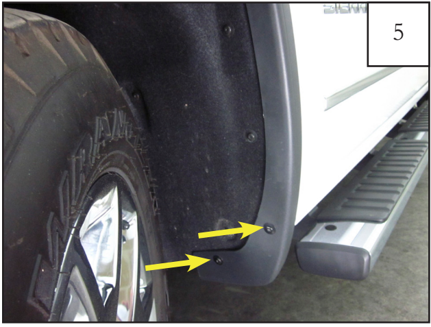
Remove two lower fasterners from factory wheel arch molding using a T-15 Torx Bit.