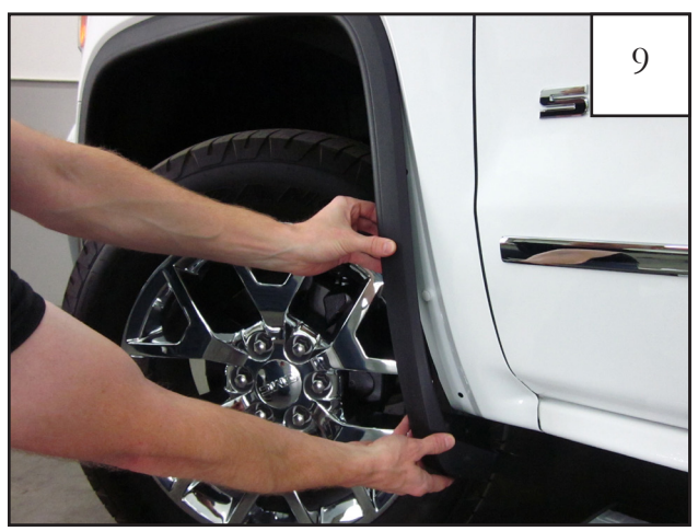
Starting at the lower rear end of the factory wheel arch molding, firmly grip part and pull to remove from vehicle. Note: You will hear popping sounds as the factory fasteners release from vehicle. This is normal.