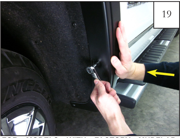
FOR MODELS WITH FACTORY MUDFLAP: Reinstall factory fastener removed from mudflap in step 2. Press flare towards vehicle while fully tightening using a T-30 Torx Bit.