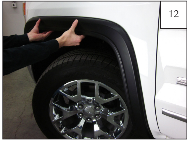
Hold Front Flare up to wheel well to confirm fit. Do not install fasteners at this time.