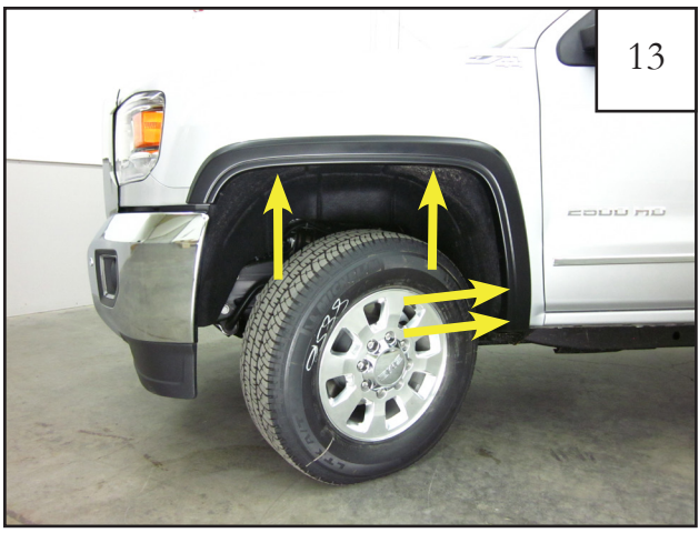
While holding Flare on vehicle, install supplied screw (SW1-0056) into the four factory hole locations as shown. Do not fully tighten at this time.