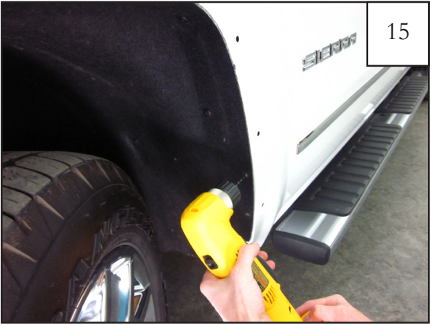
Remove the flare. Using a 3/32" drill bit, drill a pilot hole through the factory wheel well liner and sheet metal at location marked in previous step.