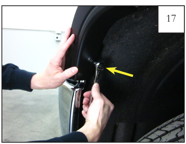
While holding Flare on vehicle, install factory screw removed in Step 4 through flare and into factory hole. Do not fully tighten at this time.