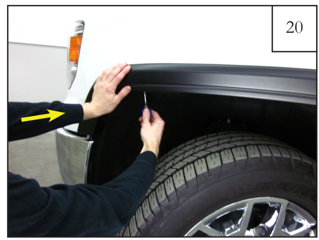
Press flare towards vehicle and fully tighten all remaining fasteners.