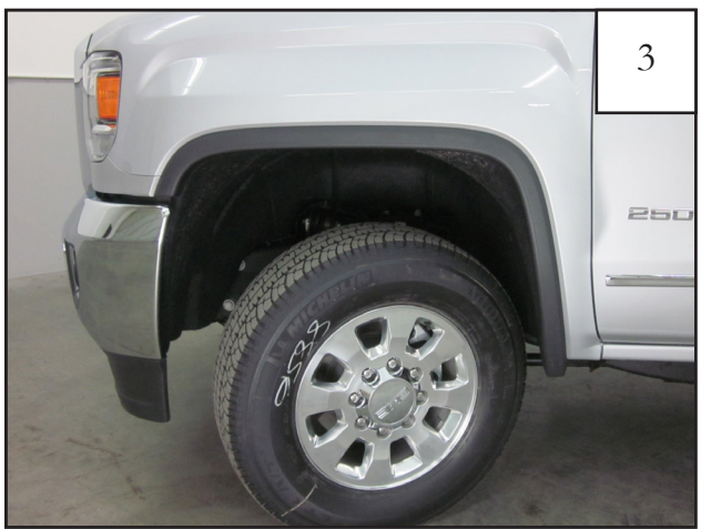
Turn front tire outward for easier installation. Factory wheel arch molding must be removed prior to part installation. See next steps.