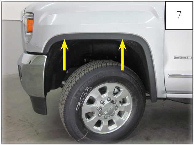
Remove two fasterners along top of factory wheel arch molding using a T-15 Torx bit.