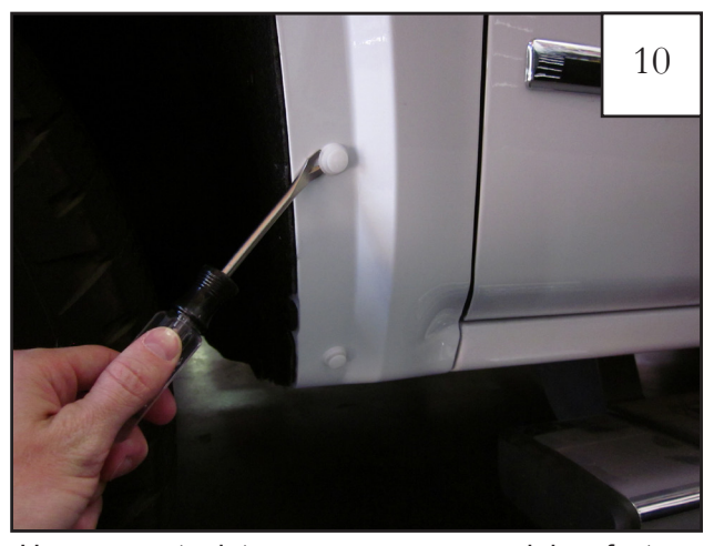
Use a pry tool to remove any remaining factory fasteners that may have stayed on the vehicle during the removal process. Clean area surface.