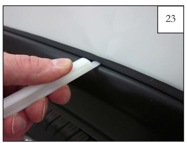
Using flat end of supplied Edge Trim Tool (ET1-0002), seat edge trim against flare by inserting straight end between edge trim and flare at one end. Next, slide around entire edge to the other end.