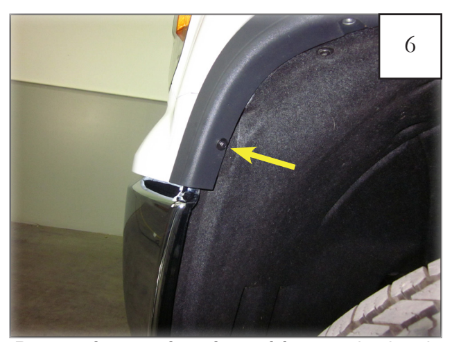
Remove fastener from front of factory wheel arch molding using a 9/32" or 7mm socket and wrench. Save for reinstallation.