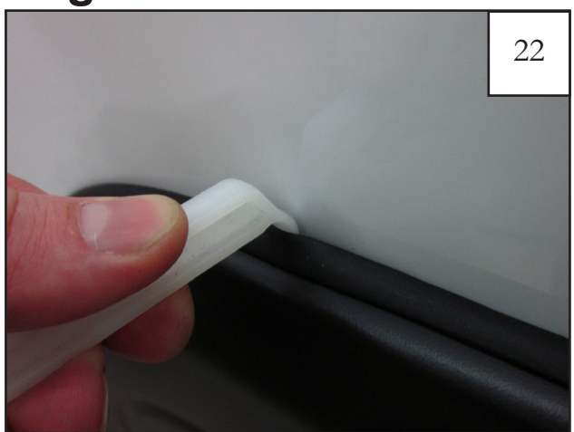
Using supplied Edge Trim Tool (ET1-0002), seat edge trim against vehicle by hooking curved end under edge trim at one end of flare. Next, slide around outer edge of flare to the other end.