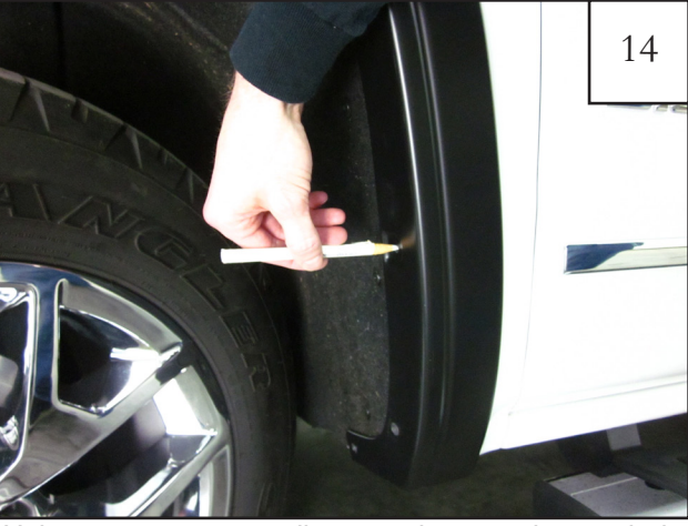
Using a grease pencil or marker, mark one hole location for drilling using the upper rear hole location in the flare as a guide. Note: This step not needed for models with factory installed mudflaps.