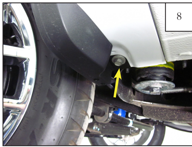
Remove fastener from rear underside of factory wheel arch molding using a 1/2" socket and wrench. Save for reinstallation.