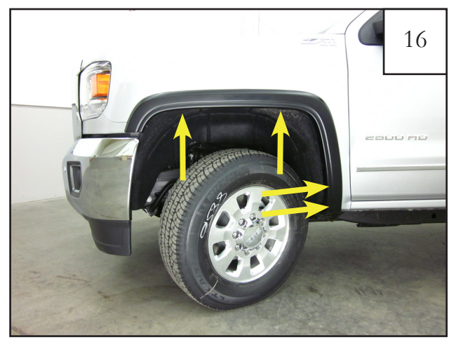
While holding Flare on vehicle, install supplied screws (SW1-0056) into the two upper and lower factory holes locations. Do not fully tighten at this time.