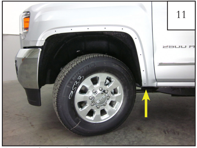
Reinstall factory fastener removed in step 8 using a 1/2" socket and wrench.