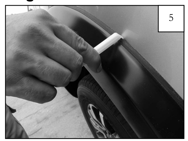
Using supplied Edge Trim Tool (ET1-0002), seat edge trim against vehicle by hooking curved end under edge trim at one end of flare. Next, slide around outer edge of flare to the other end.