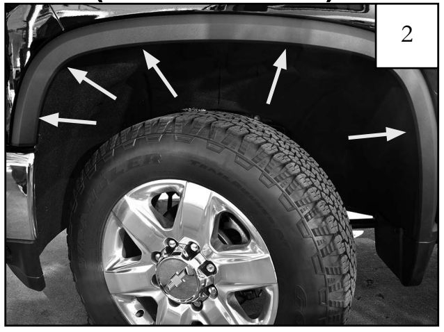
Remove (5) factory installed screws.

NOTE: There is (1) pull-nut behind flare, which is to be discarded. Pull firmly to remove splash guard.