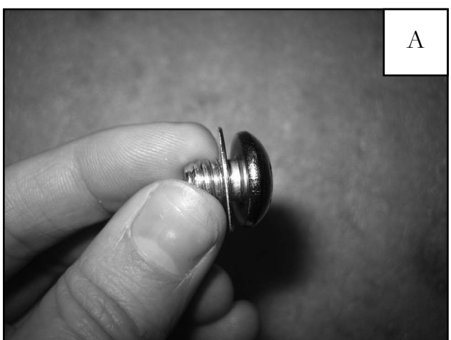
Put a Washer (WA1-0012) on each Bolt (SW1-0067).