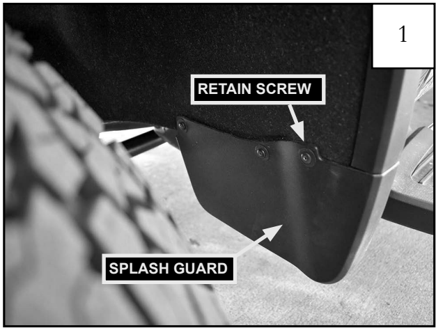
Remove the front splash guard using a T-15 Torx driver and retain (1) screw for later use.

Front Flare Installation Procedures (Driver's Side):