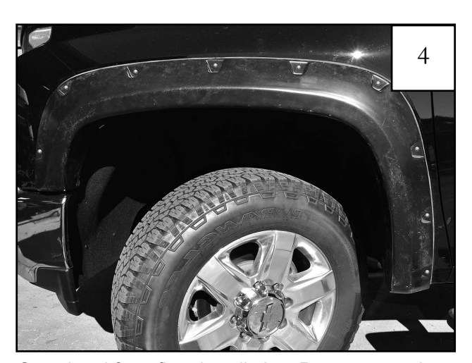
Completed front flare installation. Repeat procedure for opposite side.